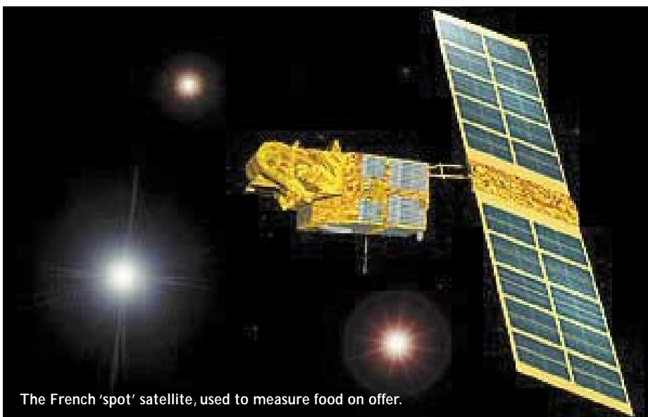
The French 'spot' satellite, used to measure food on offer.

During the growing season in Western Australia, sheep have access to a lot of food, and if left unchecked, will grow