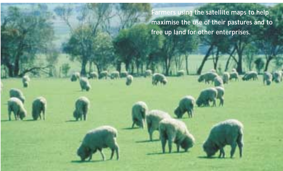
Farmers using the satellite maps to help maximise the use of their pastures and to free up land for other enterprises.

Graziers such as Bilney will then know how much to hand feed their sheep in order to maintain wool quality.