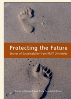
Protecting the Future Stories of Sustainability from RMIT University

Protecting the Future shows how large and diverse organisations can cut across traditional boundaries and gives case studies for those who practise, teach, research, consult, report and operationalise aspects of sustainability.