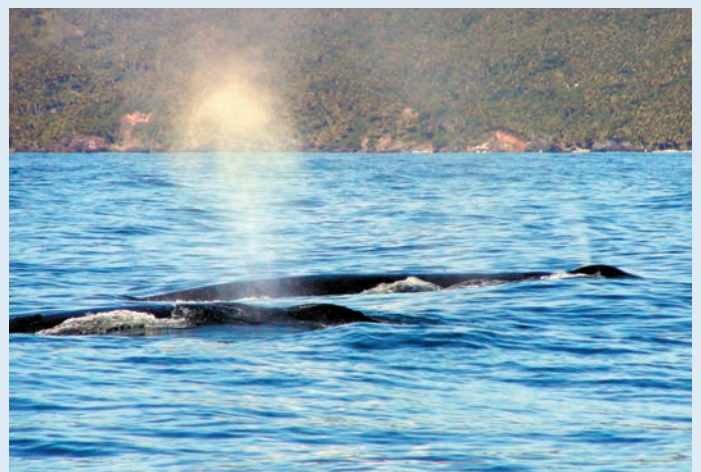
Whales' cohesive social structure appears central to mass strandings.

to strandings and research, progress on the understanding of why stranding occur, to encourage the sharing of relevant information, and to reinforce progress through capacity building, training, resource sharing and collaborative projects.