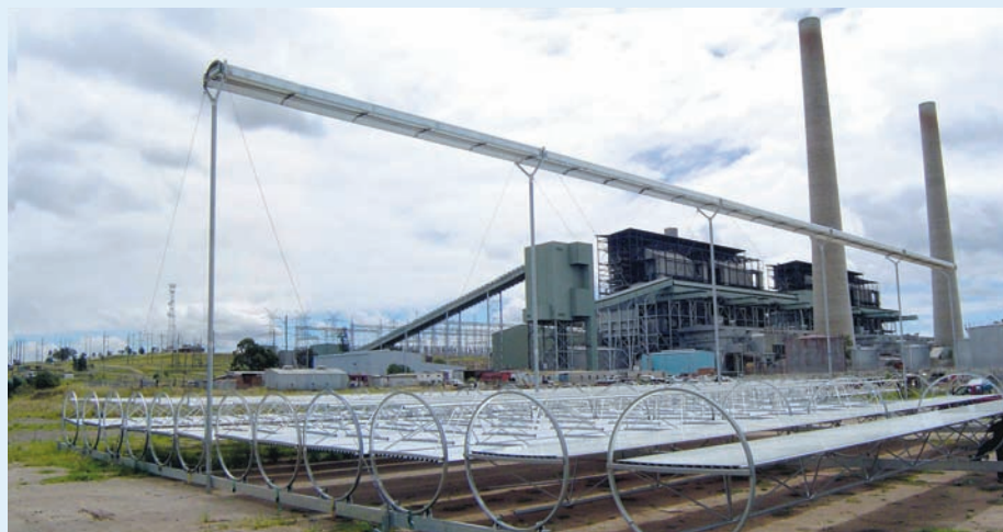
Stage one of Solar Heat and Power’s solar array at the Liddell power station in NSW. Solar Heat and Power

‘To cut a long story short, we have done the sums and we think we can desalinate at