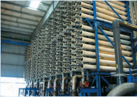
The Point Lisas Desalination Plant, Trinidad

Mills puts it differently. 'We need to use water more carefully and also obtain sources of fresh water that do not harm the environment. Whether we use one or the other should be based upon the socio-economic cost. But remember that dams remove fresh water from the natural environment by diverting water from fragile river systems or by depletion of ancient aquifers.'