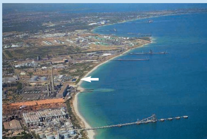
A view of Kwinana, looking south. The Perth Seawater Desalination Plant will be located south of the Western Power inlet and outlets and north of James Point as shown.