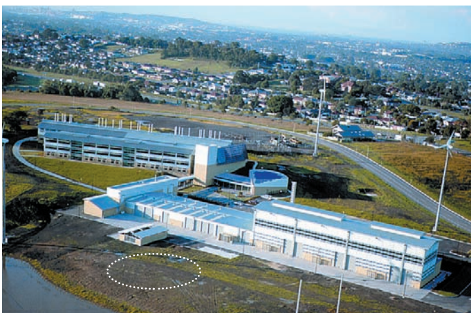
The NSETC array will be built adjacent to CSIRO's Energy Technology Centre in Newcastle, as shown.