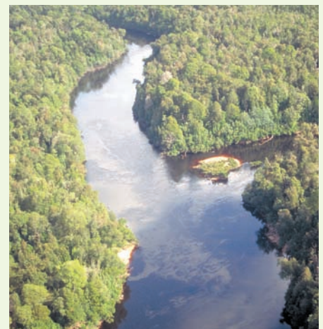
Scenery worth travelling for. Ecotourism Australia says Tasmania can look forward to an increase in jobs in the tourism industry. Suzanne Long

'These Tasmanian old-growth forest areas are now household names owing to the massive exposure they've received