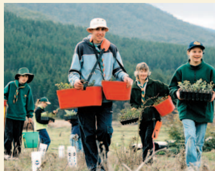
Volunteers are a big part of Greenfleet's tree planting projects. Greenfleet Australia

As they grow, the trees absorb the greenhouse gas emissions that the average