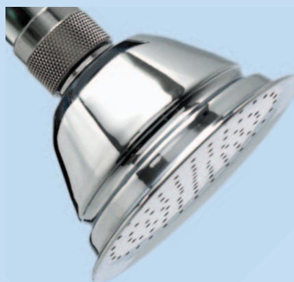
The Aerated Showerhead delivers air-packed water droplets that give the same feeling as a regular shower while saving water volume.

The aeration device is a small nozzle that fits inside a standard showerhead. Using innovative technology in the form of a Venturi tube, which creates a vacuum that sucks in air that is then mixed with