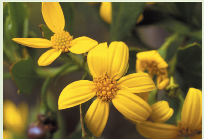
Boneseed is classified as a Weed of National Significance (WONS) – the worst weeds in Australia because of their invasiveness, potential for spread, and economic and environmental impacts. CSIRO

Glanznig says the next step in weed-proofing Australia is better control of the pathways by which weeds move around the country, which will require states and