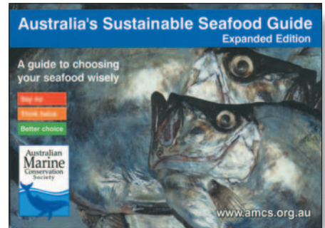
Australia's Sustainable Seafood Guide A guide to choosing your seafood wisely Craig Bohm and Kate Davey

In the meantime, arm yourself with this guide, and make your selection sustainable.