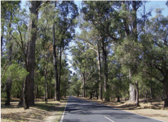
The Ludlow Tuart Forest National Park, Western Australia.