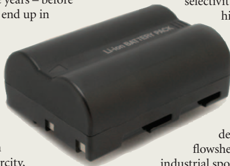
Digital cameras, laptops and mobile phones have fuelled demand for lithium batteries but global lithium reserves are limited.