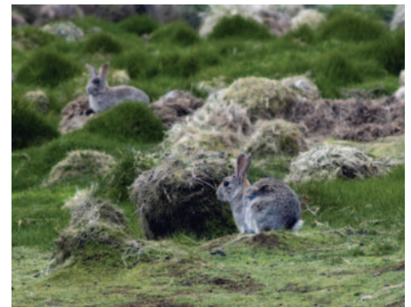
In five to six years, rabbits may have been eradicated from Macquarie Island, enabling the environment to recover. wwf

The dogs will be a vital tool in locating surviving rabbits in the rugged terrain of Macquarie Island, one of 17 World Heritage-listed areas in Australia and home