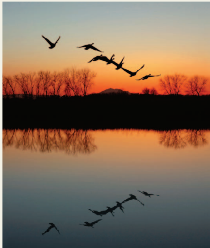
There is strong evidence that many bird migration and breeding cycles are out of sync due to global warming.

'This level of concordance is really quite remarkable, all the more so when we consider