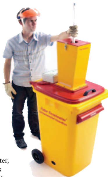
The Tube Terminator is an Australian invention that crunches discarded lamps and captures materials for downstream processing. CMA EcoCycle