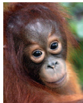
An infant orangutan from Tanjung Puting National Park, home to the world's largest wild population.

The Orangutan Fund International (OFI), established by primatologist Dr Birute Galdikas, reports that the provincial government of Central Kalimantan (Indonesian Borneo) has proposed a five-year plan to convert four million hectares of tropical lowland rainforest – prime orangutan habitat – to palm oil plantations.