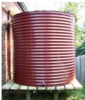
The government has allocated funds to provide rainwater tank rebates of up to $500. Richmond Tank Works

The rebates are part of a $12.9 billion, 10-year nationwide water plan – 'Water for the Future' – which includes $10 billion already allocated to the Murray–Darling. Of that $10 billion, $3.1 billion will be set aside to purchase water that will be returned to Basin waterways. A further $5.8 billion is available for rural