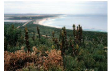
Reserves such as WA's Fitzgerald River National Park help protect biodiversity.

WWF-Australia welcomed the Australian Government's recent announcement to increase the National Reserve System's budget from $8 million to $36 million a year over five years.