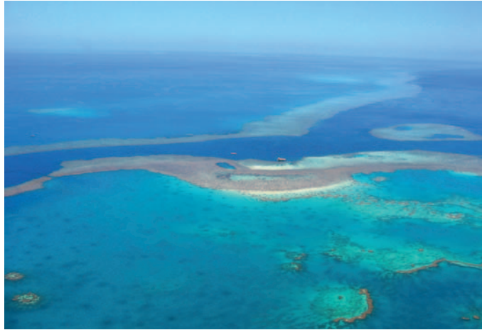
The Australian and Queensland governments want to see less fertiliser and chemical use in waterways along the Great Barrier Reef.

'Organic systems have a proven track record in delivering high water quality