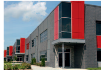
Energy efficient office buildings and factories will benefit tenants and owners in a low-carbon economy.

The commercial property sector is integral to climate change mitigation, according to a new report, 'Commercial property and climate change: exposures and opportunities', from the Total Environment Centre.