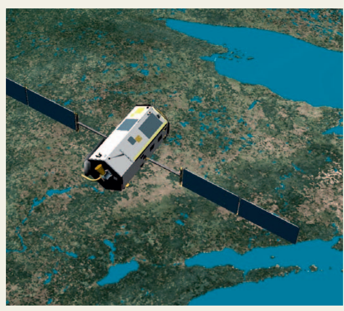
The new Orbiting Carbon Observatory will provide the most accurate maps to date of carbon dioxide sources and sinks globally.

At the time of publication, NASA was due to launch an Orbiting Carbon Observatory (OCO), designed to accurately measure concentrations of CO_2 in the lower atmosphere so scientists can more reliably determine how and where it is being emitted and recycled.