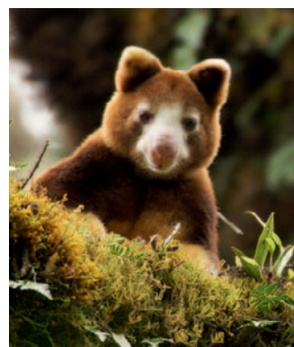
The habitat of the endangered Matschie's tree kangaroo is within PNG's new YUS Conservation Area.

The PNG Government's declaration follows years of work in the area by Conservation International (CI) and biologists from the