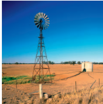
Underground aquifers supply 30 per cent of our water, yet much more needs to be known about their extent and connectivity with surface water systems. Gregory Heath, CSIRO

'We need to better understand the relationship between groundwater and the health of the rivers, streams and wetlands that support