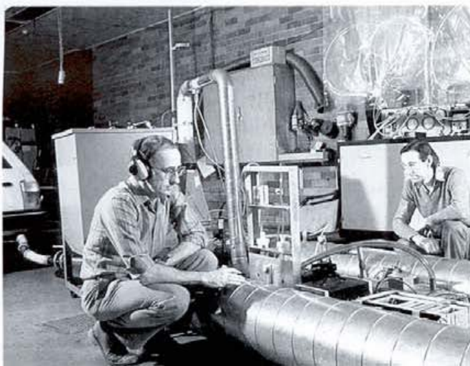
The dynamometer coupled to a test car.

'Pollution Control in New South Wales: a Progress Report.' (State Pollution Control Commission: Sydney 1983.)