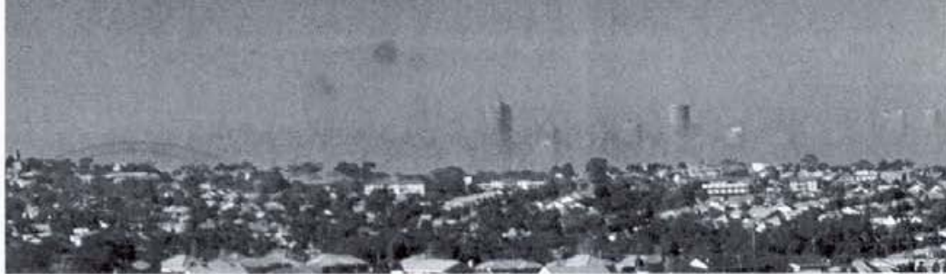
Looking like a cloud-hidden Oz — Sydney's skyline sitting in haze.

burgeoning vehicle fleet is a familiar set of air pollution problems — airborne lead, carbon monoxide, photochemical smog, and fine suspended airborne particles.