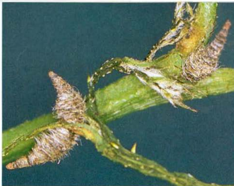
Biological control of giant sensitive plant. The adult beetles of this species feed on young shoots (left) while the larvae graze shoots at the apex of the stem.

the incidence of fire to protect improved pasture.