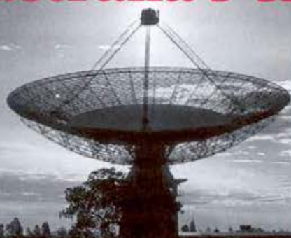
CSIRO's 64-m radio-telescope dish at Parkes, N.S.W.

Deep in the southern sky, not far from Alpha and Beta Centauri — the two bright stars that point to the Southern Cross — is the small and little-known constellation of Circinus, the compass.