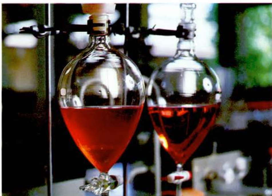
A demonstration of how a petrol-ethanol mixture separates into two phases (left), but achieves complete miscibility when 5% eucalyptus oil is added (right).

But the most important finding was the large variation between individual trees within the one subspecies. In other words, the mere fact that the eucalypt growing in your garden is a known high-yielding species does not necessarily mean that it will produce a great quantity of oil. A species can vary widely throughout its range. The scientists found significant differences even between adjacent trees.