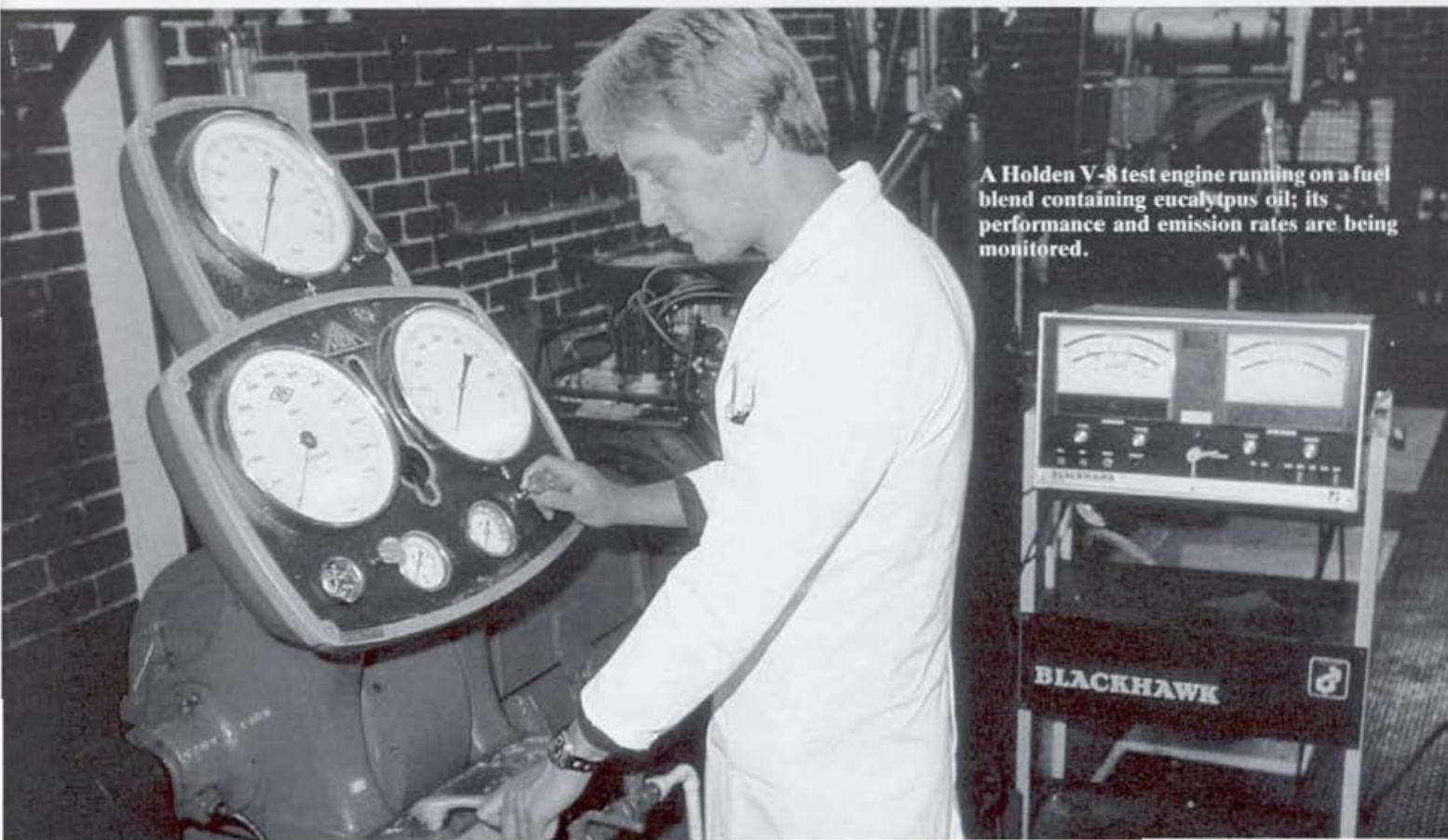
A Holden V-8 test engine running on a fuel blend containing eucalyptus oil; its performance and emission rates are being monitored.

Several reasons account for the sudden interest in this homely bush remedy. Many antibiotics can cause unwelcome side-effects, and anyway are becoming less effective as bacteria develop resistance to them. A resurgence of interest in what are thought to be 'natural' remedies is also under way and, now that the existence of plantations guarantees at least some continuity of supply, interested businesses are able to make use of this one. Finally, it is quite likely that the oil causes fewer adverse reactions than many commonly used substances. So, all of us should soon be well oiled!