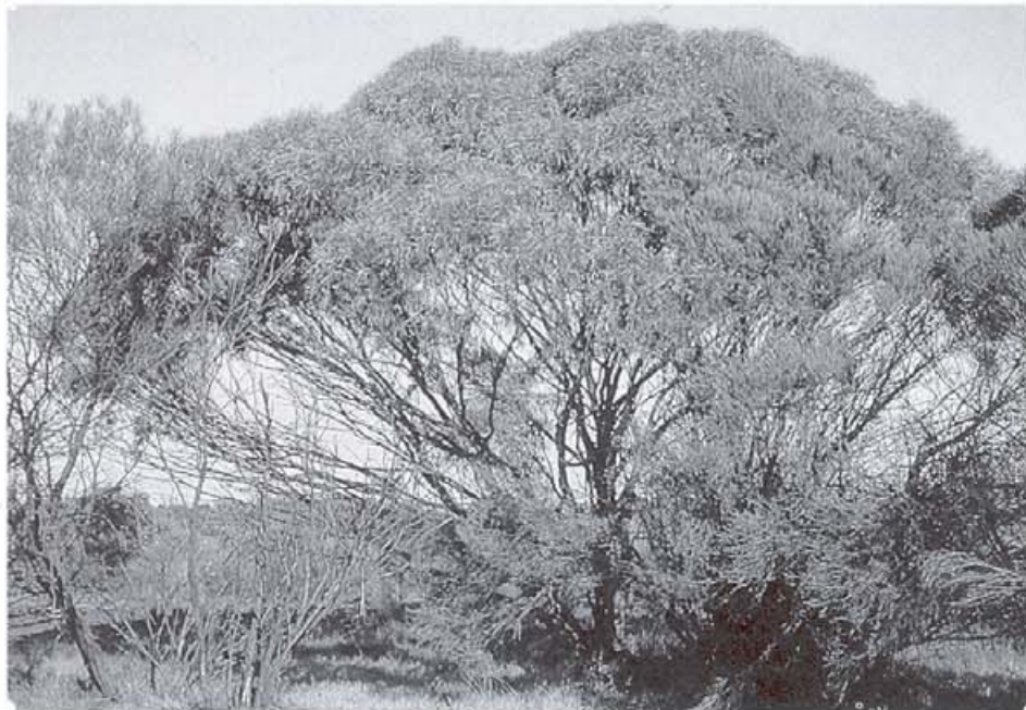
The high-yielding Western Australian subspecies E. kochii kochii .

Many Eucalyptus species, however, have never been tested for their oil quantity and