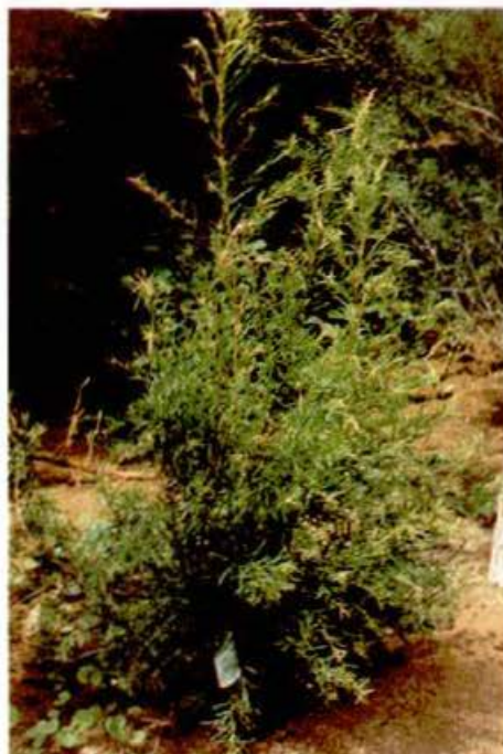
Melaleuca alternifolia showing 2 months' regrowth after cutting for extraction of tea-tree oil.

So, although we cannot yet entirely discount environment as an influence on oil yield, the variation between individuals living next to each other must presumably be genetic. If so, however, oil quantity is not a fixed matter determined by those genes unique to a species, but is susceptible to the relatively small variations that occur