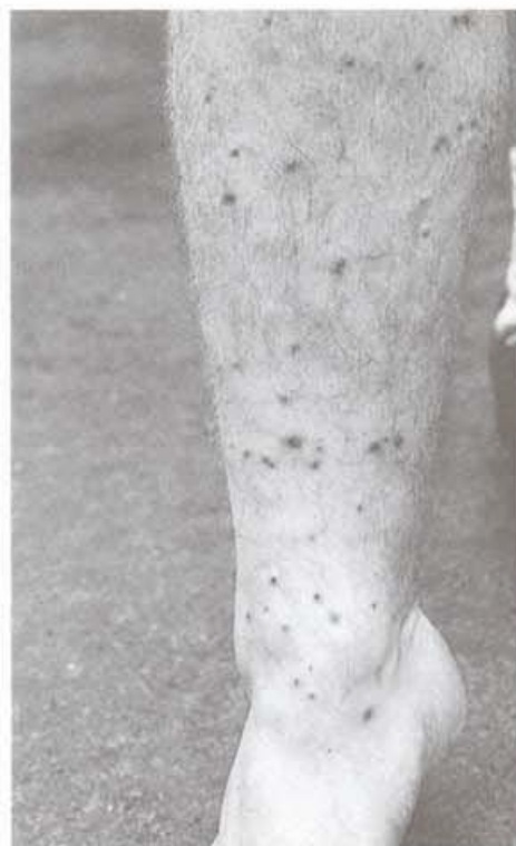
The itchy legacy of a bush-walk: tick-bites on a leg.

Tick paralysis in animals is usually fatal, and at least 20 known fatal cases in humans