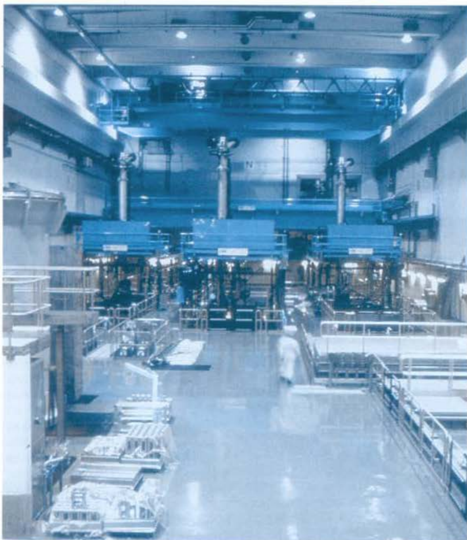
Inside a Swedish spent-fuel storage facility.

One of the biggest problems the nuclear age has brought with it is keeping track of that very dangerous substance, plutonium. Only 6 kg of the intensely radioactive material is required to form a crude atomic bomb.