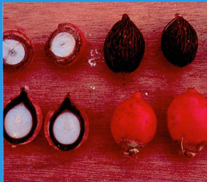
Red foxtail fruit, and what's inside. Palms grown from seed take 8–12 years to start producing their own seed.

they had been at work. Fortunately, however, they appeared to have collected seed only at the edge of the area occupied by the palms.