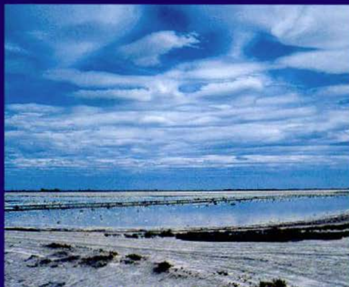
Wakool/Tullakool is far from the ideal environment for research: water temperatures can rise to 45°C.