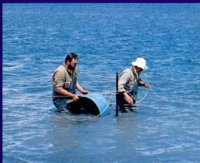
Installing seepage meters in 45-degree water and stinging salt made this aspect of research far from enjoyable.

As these plants lower water tables and 'lock up' salt below the surface, they will eventually create micro-environments that allow less salt-tolerant species to survive.