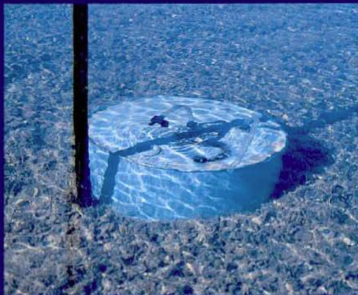
A seepage meter in place: the evaporation bays' clear waters made monitoring easy.