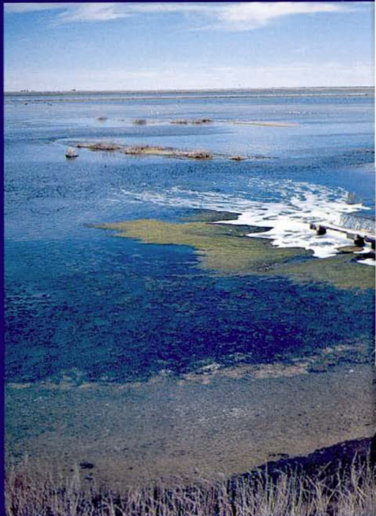
Tube-wells pump 15 000 megalitres of saline groundwater into the Wakool/Tullakool Scheme every year.

in combination with irrigation — by raising the groundwater and the salt stored in those aquifers to the surface — has made an increasing amount of the Basin's fertile soil