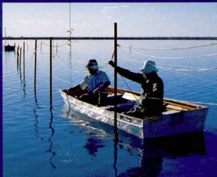
Researchers check the cables leading from remote sensors to the mobile laboratory.