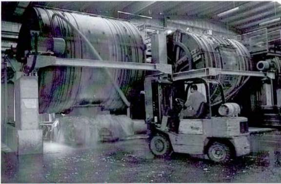
Recirculating tanning drums of the kind suited to the Sirolime process.

carried out in Australia and, because it uses conventional chemicals and techniques, albeit in novel ways, can involve relatively little outlay. While the process requires specially designed tanning drums, potential savings are significant, and two Australian tanneries are already using the process.