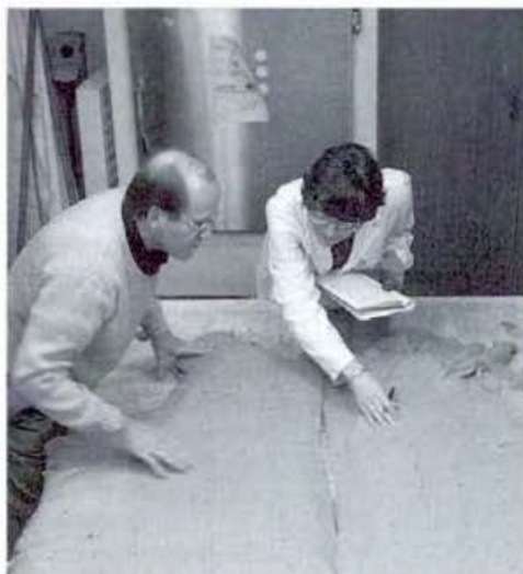
Leather Research Centre scientists examine a hide, split down the middle and processed using the conventional technique and Sirolime. The side on the right of the photograph, unhairing using Sirolime, is noticeably cleaner.

Chromium-3 — trivalent chromium, or {}^3\text{Cr} — is naturally present in the environment, often in soils at a level of 100 parts per million (p.p.m.). It has low toxicity and is actually an essential trace element, vital to carbohydrate and lipid metabolism. Tannery effluent contains only {}^3\text{Cr} , and not the more toxic hexavalent {}^6\text{Cr} .