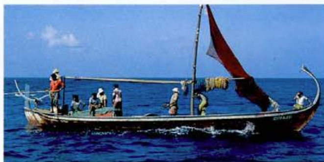
Catching tuna off the Maldives — with pole and line in a 'dhooni', or local boat.

Diets of lagoon fishes of the Solomon Islands: predators of tuna baitfish and trophic effects of bait-fishing on the subsistence fishery. S.J.M. Blaber, D.A. Milton and N.J.F. Rawlinson. Fisheries Research , 1990, 8, 263-86.