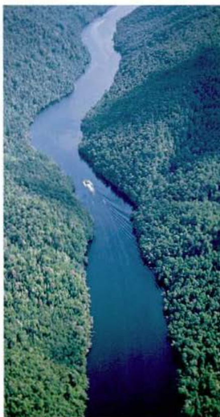
Australian Overseas Information Service

But what of copper? At every sampling site, both in the King River and Macquarie Harbour, the team found that the copper concentration exceeded the complexing capacity of the organic substances in the water, despite the strong