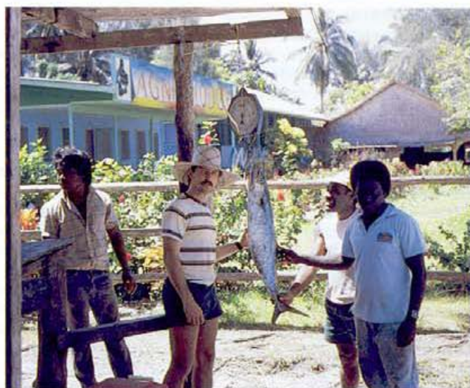
Weighing the catch after one of the bait-fish-catching competitions.