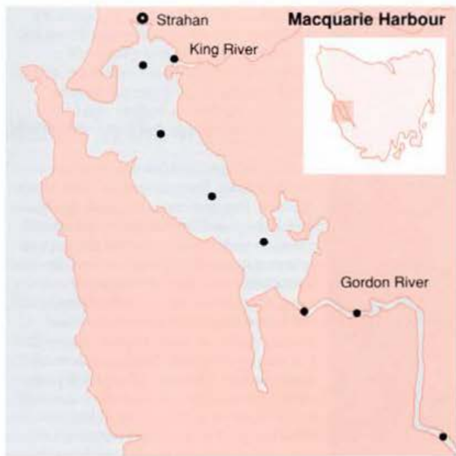
The dots show the sites where the scientists sampled water.

metals, but the flesh and bone would be spared — and anyway, dead fish are not for human consumption. Also, as the fish are artificially fed and their food does not come from Macquarie Harbour, they do not form part of the natural food chain there and so would not normally take in metals in any significant quantity. Hence, the fact that the water in the area exceeds guidelines for fish-farming from elsewhere may be a worry for the farmers but not for the consumers.