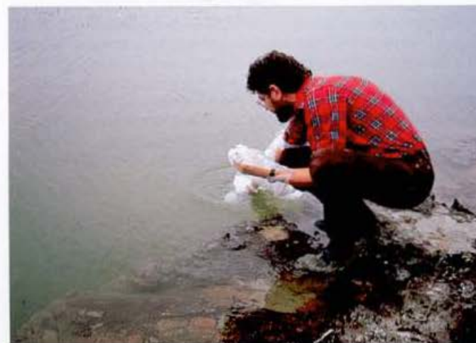
... and lower King River