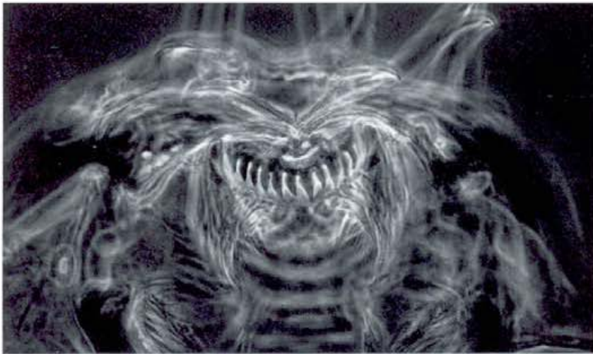
The face of a Biotest indicator: much magnified, the larval head of a midge, Chironomus salinarius , collected from water at a chemical plant near Odessa on the Black Sea.