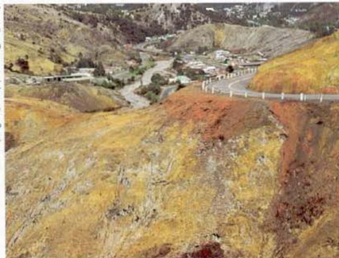
The denuded hills around Queenstown — the result of mining and smelting in the region.

The area also interested oceanographers because it offers a natural laboratory for the study of water-mixing and estuaries, with rivers draining into a large body of water that has only a small outlet to the sea (see the map on page 32). Many of the chemical processes that occur at the boundary between rivers and oceans are still poorly understood. Field studies taking into account several pollutants and their possible interactions in estuarine systems are lacking.