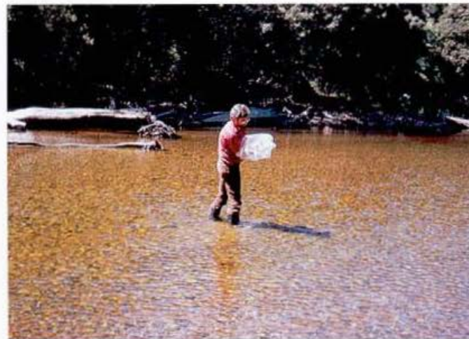
Sampling for trace metals in the upper...