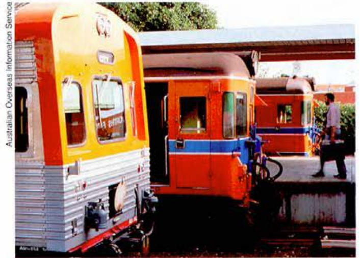
Will they leave, and arrive, on time?

Trains on single-line networks must stop at sidings or 'crossing loops' and wait for others to pass. Energy and time are wasted if one of two trains gets to a siding much before the other. Traditionally long-haul trains are driven flat-out and controllers will attempt to move them through a network as quickly as possible, resulting in high fuel costs and longer-than-necessary delays at crossing loops. Big savings can be achieved by slowing some trains in a way that reduces waiting time at crossings. The Dynamic Rescheduler calculates a crossing schedule for all trains on a network for the next 24 hours, minimising the 'cost' of each journey in terms of energy use and lateness. The data are then transmitted to each train and updated every 15 minutes. While the system has similarities with Metromiser, the computational task is more complex due to changes in the weight of the train and wind direction during the journey.