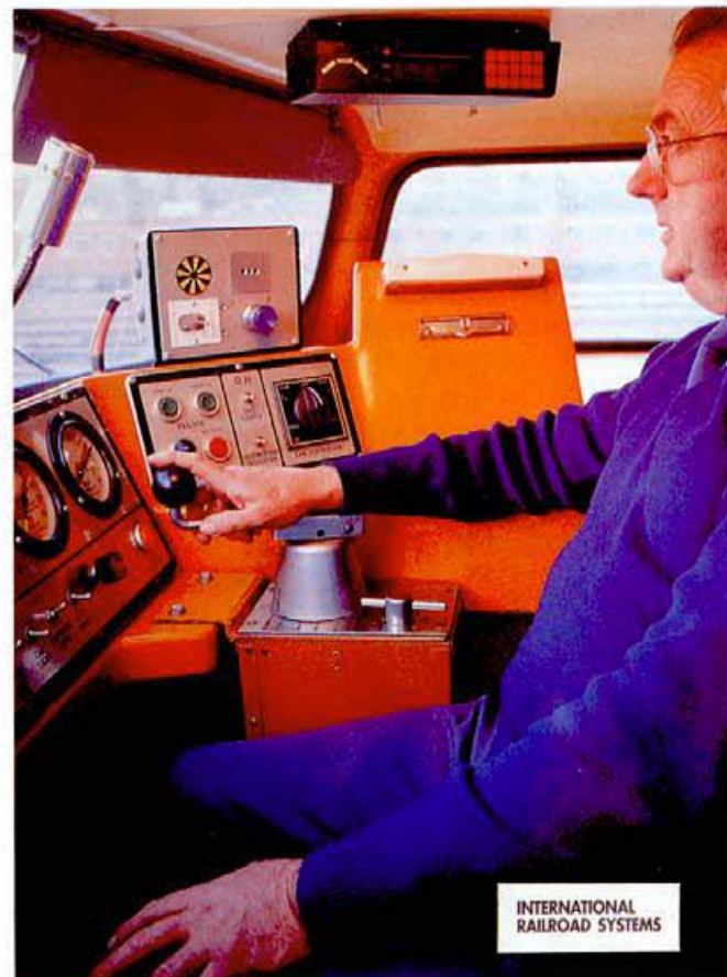
Metromiser in the train cabin.