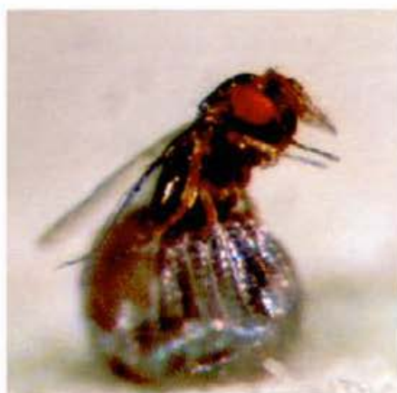
A female Trichogramma wasp emerges from the egg of a Heliothis moth after consuming the moth larva within.