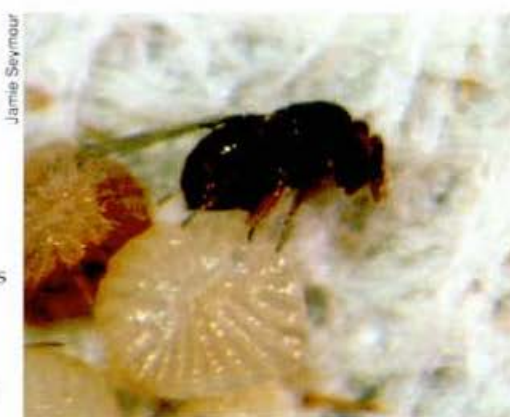
A Trichogramma wasp lays its egg inside that of a Heliothis moth.