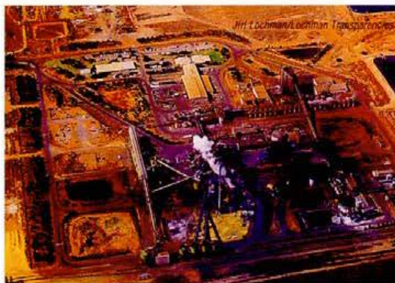
Strict regulations govern the environmental impacts of today's industries. A legacy of uncontrolled industrial practices in the past is the existence of many sites contaminated with hazardous wastes. Researchers at CSIRO's Division of Coal and Energy Technology are working with industry to develop efficient ways of dealing with the problems on site.

Electrokinetics is an excellent method of moving metals and water in the soil and gathering them at a common electrode where they can be collected and removed. As such it has already been applied to soil cleaning and dewatering. The limitation of